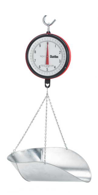
Shown with optional CG Scoop